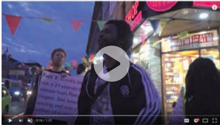
Waking the Sleeping Giant | Official Trailer #1