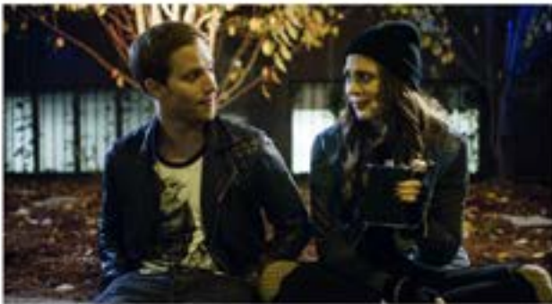
Sully and Violet make up