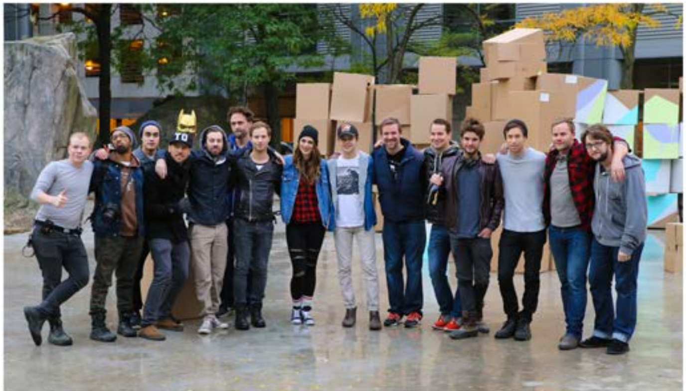
last crew left standing