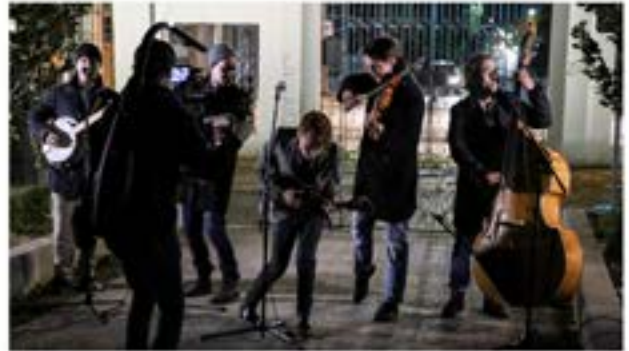
and Birds Of Bellwoods