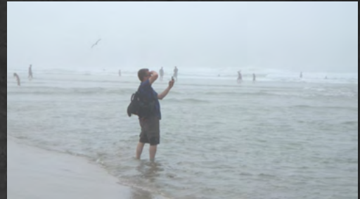
A journey across North America