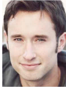
MATT MERCER Director / “Ralph”

Born and raised in Concord, California, Charley Koontz graduated from De La Salle High School in 2005. He went on to earn a Bachelor's Degree in Theatre Arts from Loyola Marymount University in Los Angeles, CA in 2009. Koontz is best known for his work as 'Fat Neil' on the NBC sitcom Community . Charley's other television credits include Perfect Couples (NBC), Awake (NBC) and a recurring role on the USA Networks' Royal Pains . He is part of the Los Angeles-based Shakespeare theatre company Will and Company. His first film, Rubber , directed by Quentin Dupieux, premiered at the 2010 Cannes Film Festival and has garnered an enthusiastic and dedicated cult following. He worked with Dupieux again on the 2011 film Wrong . His film credits also include 2013's Contracted and the prison-set paranormal thriller Apparitional . He now appears as FBI Agent Daniel Grummitz in the CSI: Crime Scene Investigation spin-off, CSI: Cyber .